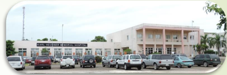
Karl Heusner Memorial Hospital Princess Margaret Dr., Belize City 501-223-1548